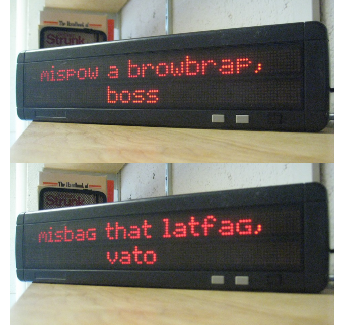
Figure 1. Example output from ppg256-4.

ppg256-4 was developed to drive an LED sign in an art gallery and contains all of the control code necessary to drive the sign. This generator produces a set of utterances – vaguely aggressive commands that include coined kennings. The utterances are meant to suggest a speaker of a certain gender (male) and to highlight how racial standing influences everyday speech with terms such as "dogg" and "vato.". The possible lexical combinations for a syllable include "fag," an offensive term that is in keeping with the tone of the generator and can remind a reader that offhand expressions include reference to sexuality as well as gender and race. These texts are further constrained to fit on the LED display: